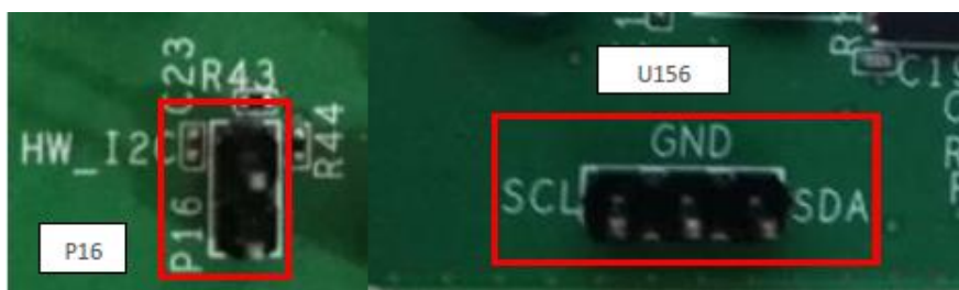
Figure 1: External I2C

The I2C bus can be accessed externally using U156 pins. In this case a jumper should be placed on pin header P16 (HW_I2C) shown in the image below.